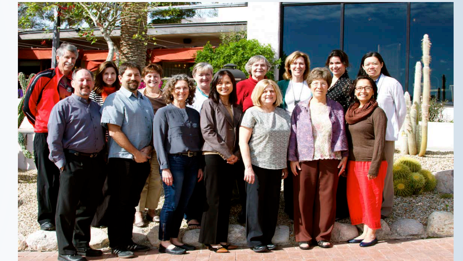
The NCIPH Team

Using Competencies to Create Active Learning Exercise